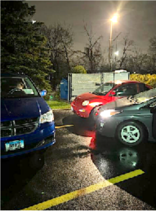
Submitted by Marty N9LE