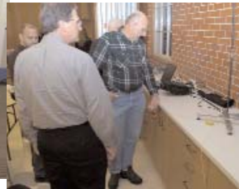
2005 in Review