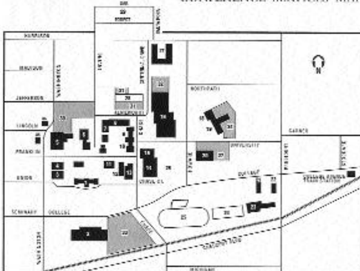
WHEATON COLLEGE CONFERENCE SERVICES MAP

right until you reach the elevators and then turn left and walk south until reaching the corridor that will take you to classroom #138.